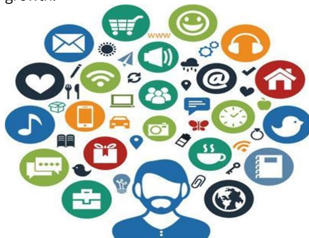
Figure 1 showing the learners gain practical knowledge

Enrolling in such courses not only helps learners gain practical knowledge but also equips them with confidence to excel in real-world scenarios, making them invaluable resources for personal and professional growth.